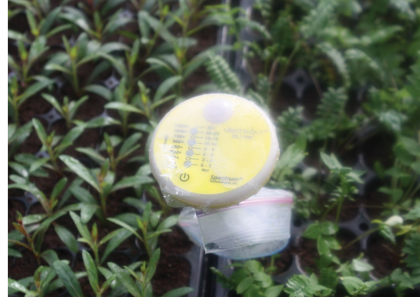
Figure 2. The quantum sensor on this daily light integral meter is covered in a plastic bag to keep excessive moisture from mist off the sensor. However, notice the fog and condensation building up inside the bag, ultimately reducing the accuracy of these measurements.

This article is the third in a five-part series. Visit GreenhouseGrower.com to read about monitoring plants and substrate temperatures with infrared thermometers and keeping track of pH and EC. Next up in the series: Adding Carbon Dioxide to Your Greenhouse.