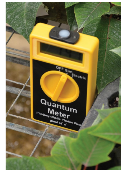
Figure 3. Note that the sensor on the quantum meter is right at the canopy level of these rooted poinsettia cuttings. Placing quantum sensors at the plant canopy will get the most accurate measurements of the light the plants are growing under.

which is why we use units that quantify the light used for plant growth and not the human eye. There are two different ways to measure quantum light: instantaneously or cumulatively. Light is quantified as micromoles per square meter per second ( \mu mol \cdot m^{-2} \cdot s^{-1} ) when measuring light instantaneously. Alternatively, when quantifying the amount of light over the course of a day, light is quantified as mole per square meter per day ( mol \cdot m^{-2} \cdot d^{-1} ).