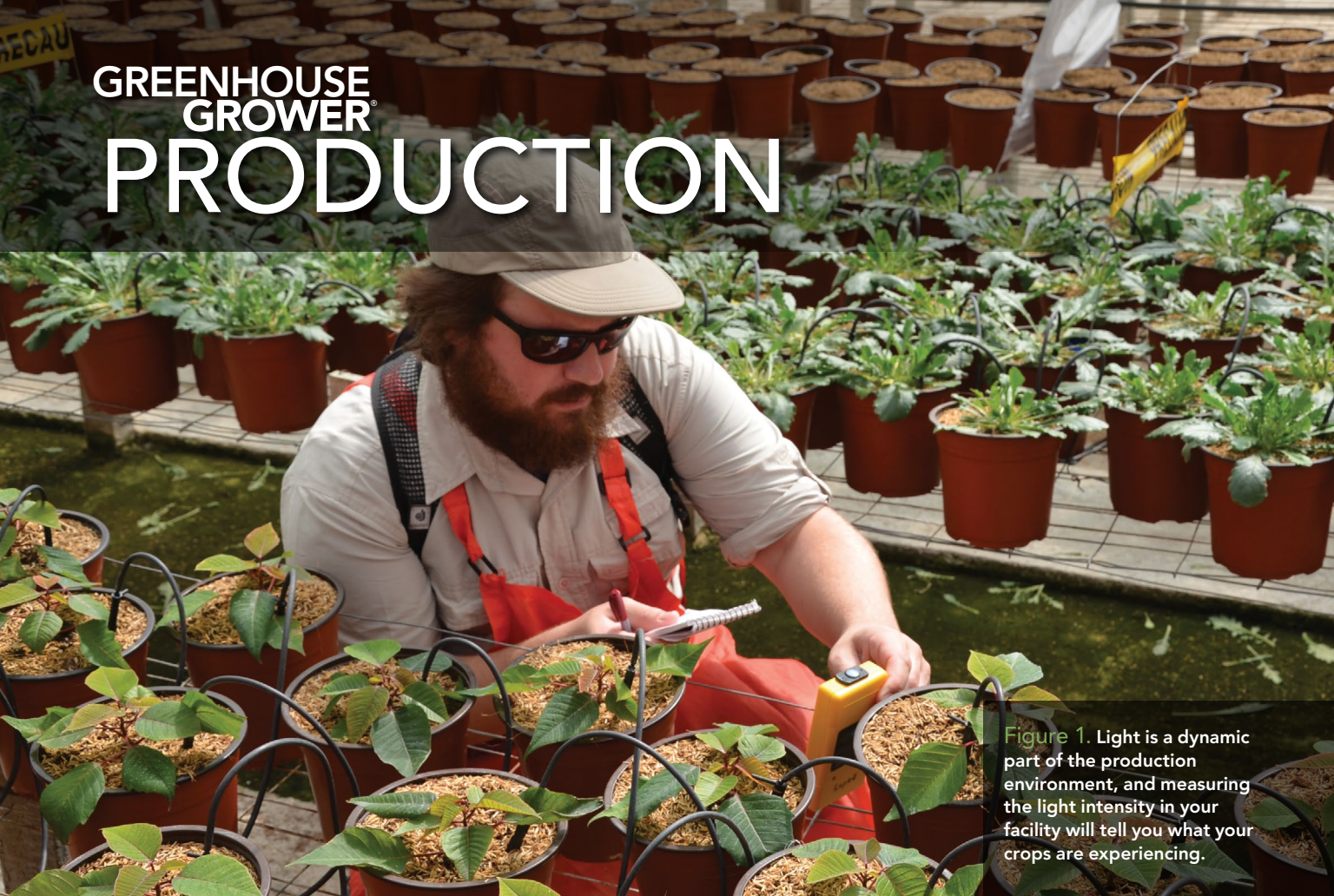
Figure 1. Light is a dynamic part of the production environment, and measuring the light intensity in your facility will tell you what your crops are experiencing.